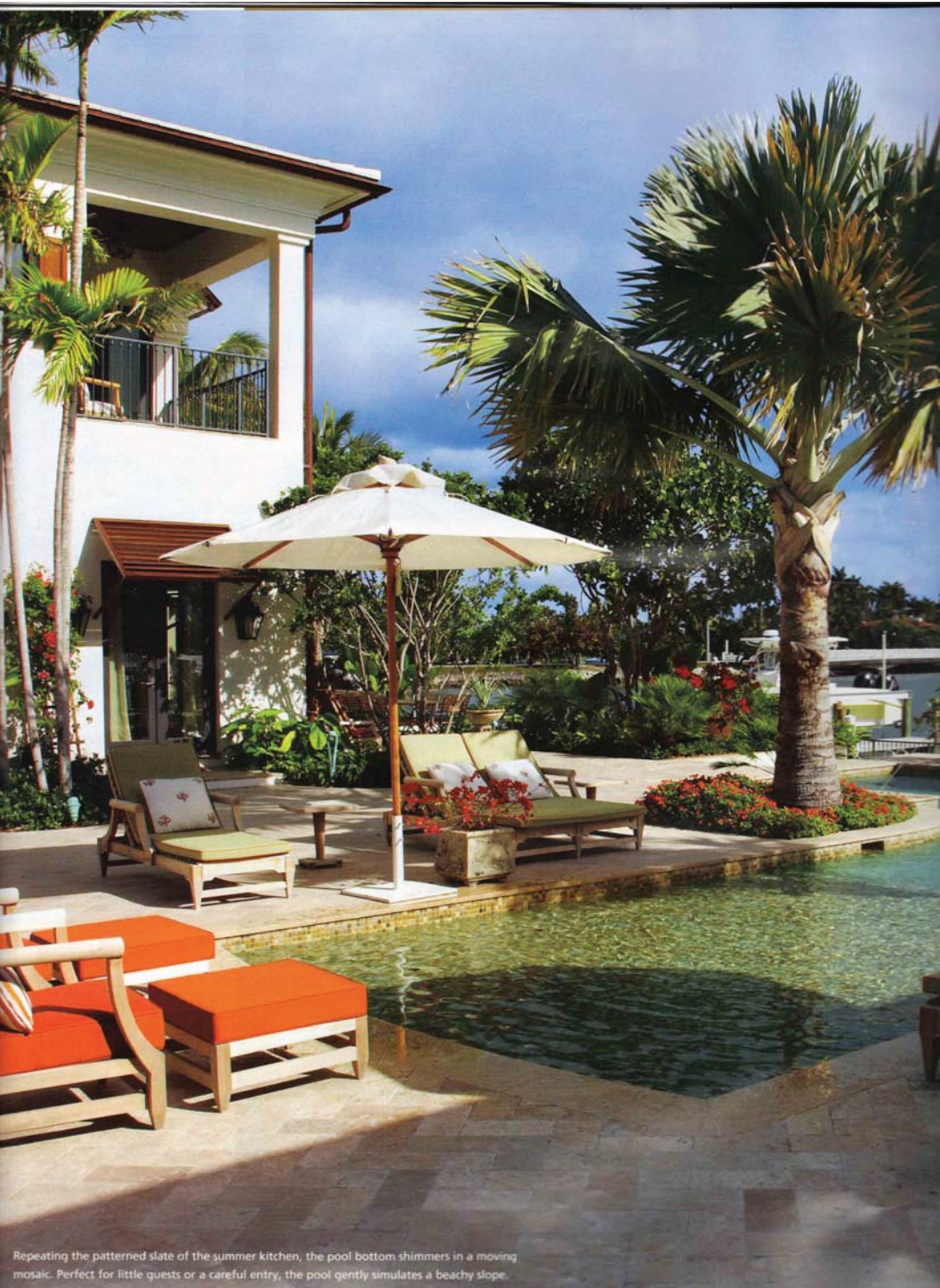
Repeating the patterned slate of the summer kitchen, the pool bottom shimmers in a moving mosaic. Perfect for little guests or a careful entry, the pool gently simulates a beachy slope.