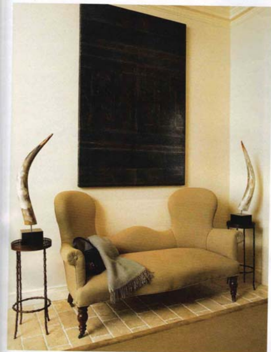
ABOVE: In this hallway vignette, a pair of sculptural horns, bamboo occasional tables and white limestone brick flooring all give an organic texture to balance the sinuous softness of the unique loveseat.