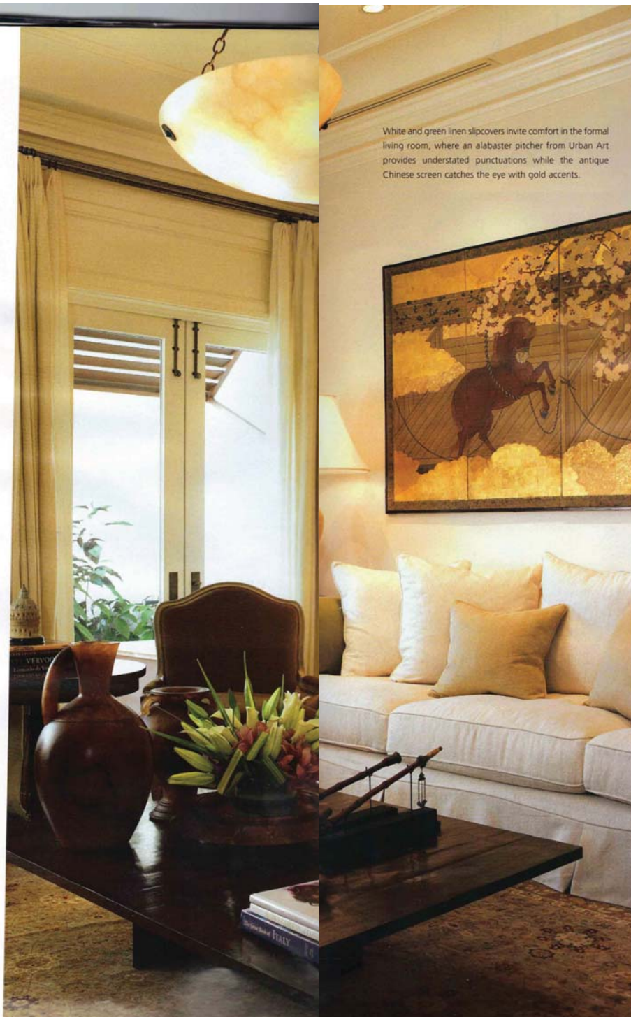
White and green linen slipcovers invite comfort in the formal living room, where an alabaster pitcher from Urban Art provides understated punctuation while the antique Chinese screen catches the eye with gold accents.

And with little more than a shell to start with, the estate fashioned with clean lines and traditional warmth now glows with luxurious livability inside and out. A 17th-century gate announces the entry as the eye is led between the main house and the guesthouse through a wide walkway toward the sprawling pool. With its custom-designed Bahama shutters, teak furniture, gazebo-covered Jacuzzi, and