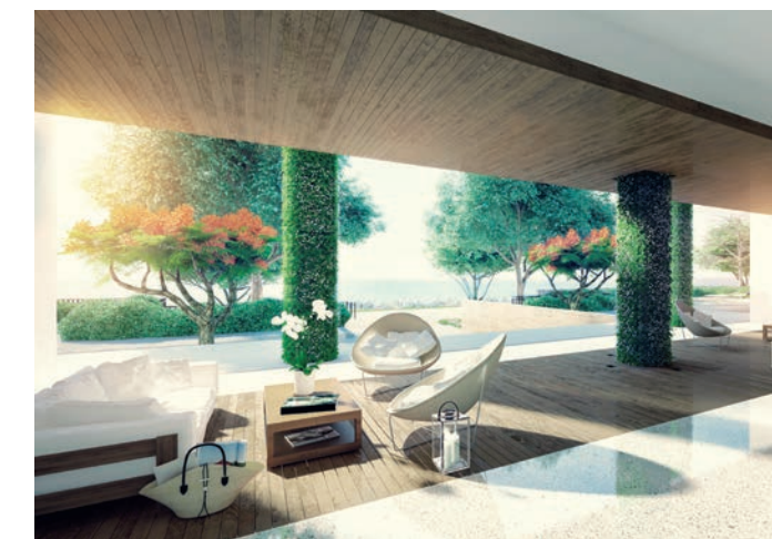
PHOTOGRAPHY COURTESY OF ANTROBUS RAMIREZ (LOBBY, PENTHOUSE)