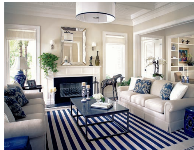
PHOTOGRAPHY COURTESY OF CHARLOTTE DUNAGAN (BEDROOM, LIVING ROOM)