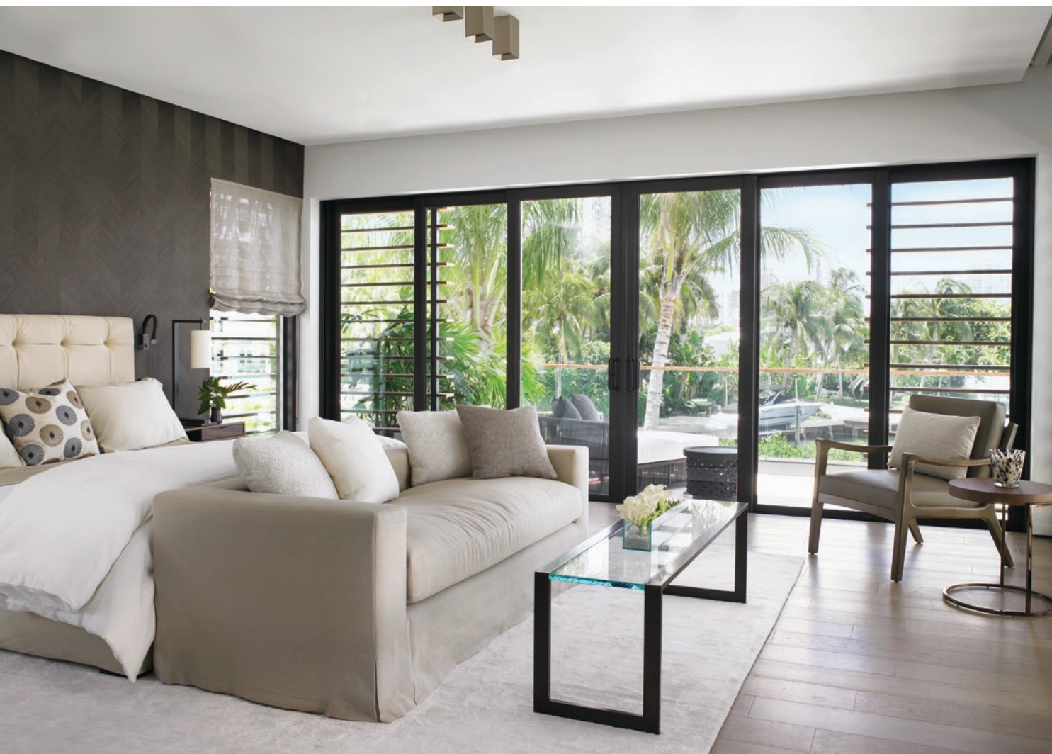
ABOVE: Views of lush tropical foliage and the pristine shoreline of Miami Beach ... what a way to awake! Positioned to take in the alluring vistas as well as the owner’s favorite shows on Visual Acoustics’ retractable film screen with projector, the soft and supple sofa takes on a slightly darker shade of taupe that blends beautifully with Niba’s ivory wool area rug.

“It was my vision to create and build a unique product in Miami, something modern but warm, cozy and relaxing,” Massa says. It was a mission accomplished for all.