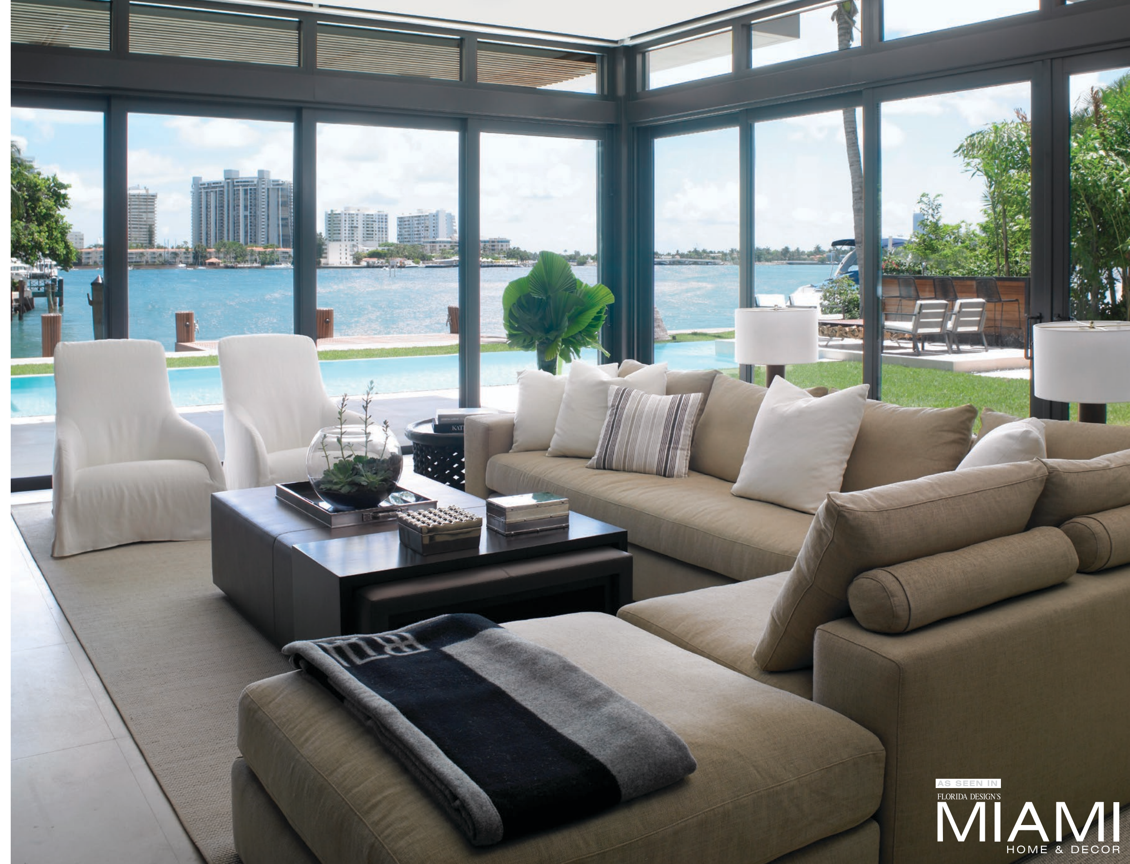
ABOVE RIGHT: Designed to be warm and inviting, practicality is punctuated in the family room. Here, a deep-seated sectional sofa from Monica James joins an oversized faux-leather cocktail ottoman that functions as a coffee table with its movable walnut wood tray, and MaxAlto’s slipcovered chairs that swivel to enjoy the bay views and cityscape beyond.

AS SEEN IN FLORIDA DESIGN'S MIAMI HOME & DECOR