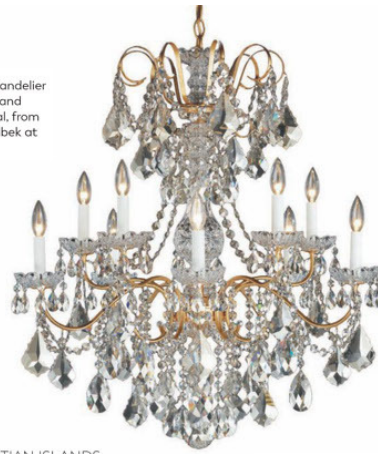
New Orleans chandelier with gold finish and Swarovski crystal, from $2,195, by Schonbek at farreys.com