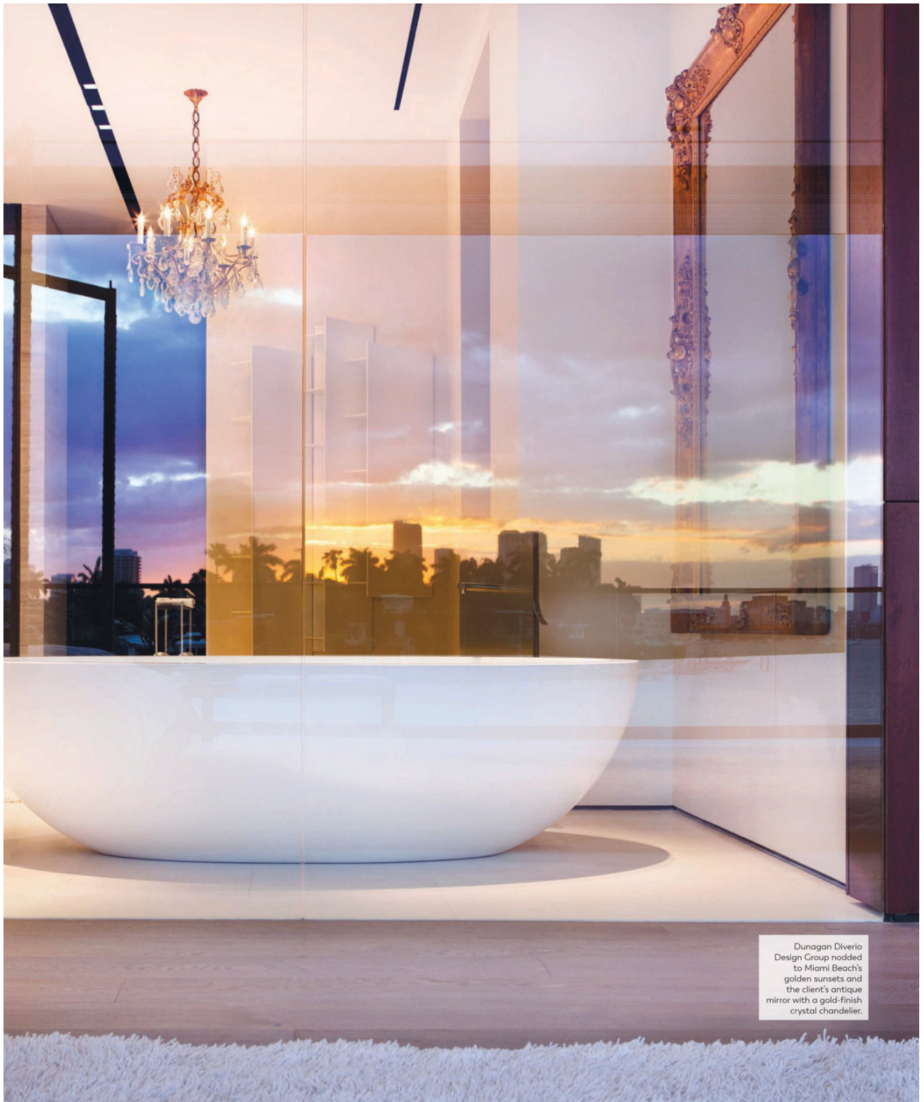
Dunagan Diverio Design Group nodded to Miami Beach's golden sunsets and the client's antique mirror with a gold-finish crystal chandelier.