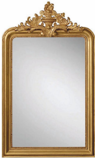
The Louis Philippe gilt mirror from RH approximates the home's antique mirror. From $521, restorationhardware.com