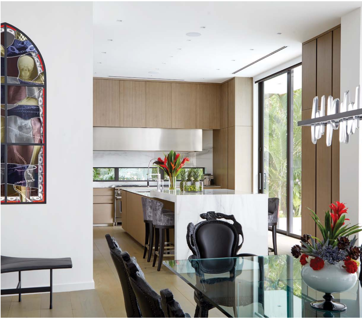
ABOVE: The cocoon-like "Zeppelin" chandelier designed by Marcel Wanders creates a whimsical effect in the breakfast nook. Here, Kartell's "Masters" side chairs circle Holly Hunt's "Peso" table to create a casual dining spot to enjoy light fare and easy conversation.