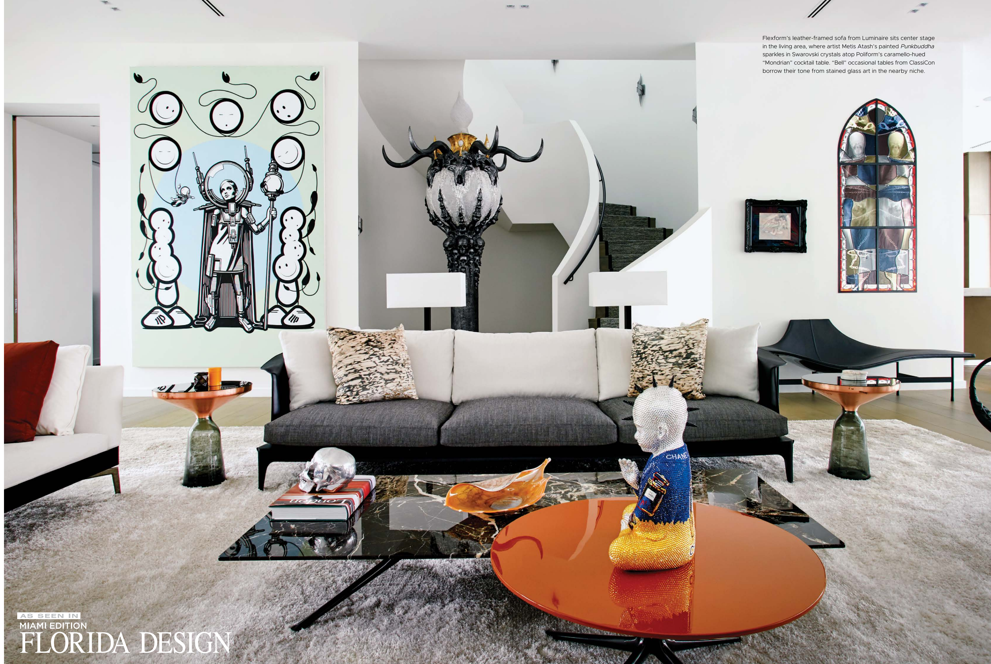
Flexform's leather-framed sofa from Luminaire sits center stage in the living area, where artist Metis Atash's painted Punkbuddha sparkles in Swarovski crystals atop Poliform's caramello-hued "Mondrian" cocktail table. "Bell" occasional tables from ClassiCon borrow their tone from stained glass art in the nearby niche.

These materials are continued in the back of the house on a sweeping, open veranda that sits on 80 feet of waterfront. A cool architectural overhang provides shade as needed, and on the upper floor, aluminum louvers finished in bronze do the same without blocking natural light. Though the outdoor furnishings are largely neutral, there are lots of pops of red in accessories. "The owners love reds and oranges," Dunagan says. "We