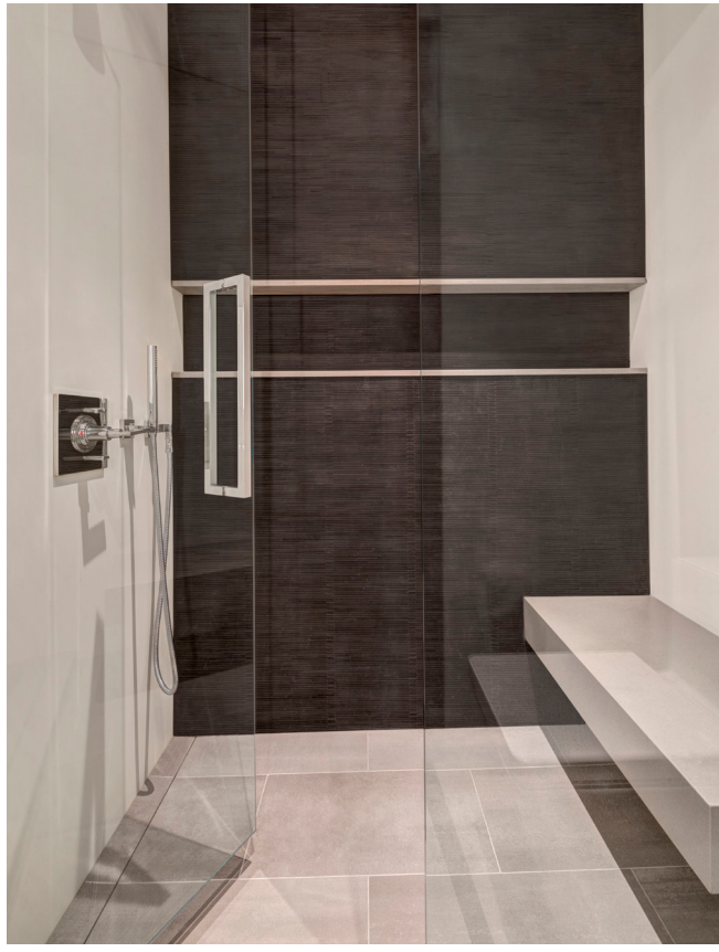
"The more abstract and clean the lines, the less opportunity to hide imperfections. [This] means construction standards have to be essentially perfect. No place to hide. Absolutely zero room for error."

millwork and furniture in Miami; Hans Krug cabinetry; Miele appliances and Hakwood flooring from Wekendam, Netherlands. "Hans Krug Charlotte even provided tailor-made custom cabinetry and doors for our master closet room design," adds Charlotte, "We were very pleased with the Charlotte-based team."