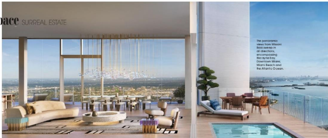
The panoramic views from Mission Boca sweep in all directions, encompassing Biscayne Bay, Downtown Miami, Miami Beach and the Atlantic Ocean.

and foyer, totaling 5,709 square feet of visionary living. The flow-through unit is outfitted by New York interior designer Paris Forino and captures the essence of Miami's sun, sky and sea in Missoni's iconic patterns. In the kitchen, Blue de Savoie marble countertops and white lacquer custom-designed European kitchen cabinetry backdrop top-of-the-line appliances. Amenities include personal concierge, valet parking service, hair and nail salon, kids' services, pet spa, Olympic-sized pool and lounge pool, poolside daybeds, outdoor barbecue and cabana bar, elevated tennis court, wraparound deck and bayside terrace with cantilevered pool, billiard room and a 3,208-square-foot gym with 180-degree views of the bay. The richly layered landscape designed by Enzo Enea wraps the whole property in a lovely bow and sets a new standard for quality and sophistication in East Edgewater. 777 NE 26th Terrace, Miami, 303.800.7000, missionibata.com