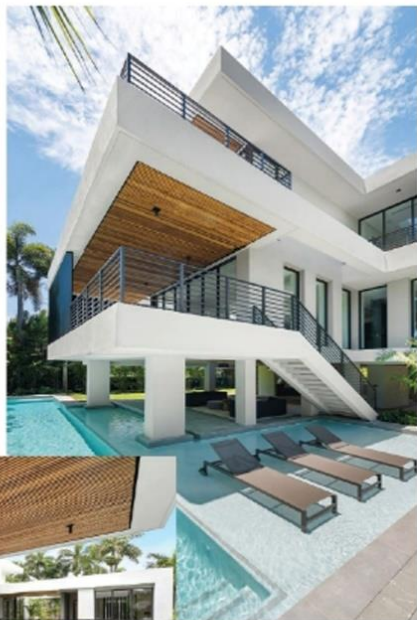
From top: The 2,356 under-air square footage at 3608 Stewart Ave. wows with pools and shade; the balcony off the family room is a nice transition area and gets a breeze from the east and is ultraprofite thanks to the tall landscaping that surrounds it.

windows illuminate a well-thought-out floor plan that features a 250-plus-bottle glass wine room, elevator, flex room, second family room, five carports, gourmet kitchen, multidepth heated double pool, summer kitchen, two storage rooms and an extra-large pantry. The seven-bedroom, 7 1/2-bath home features a master with an off-the-room terrace and an oversized master bath and closet. The gourmet matte black kitchen with natural wood accents is outfitted with Mia Cucina cabinets, ample pantry space and Wolf appliances, Sub-Zero refrigerator, freezer and wine cooler. Outside, the extensive grounds are perfect for entertaining with a summer kitchen and covered areas for gathering. 3608 Stewart Ave., Miami, Anabella Hidalgo, Braun Harris Stevens, 305.302.8118, bhsMiami.com , ahidalgo@bhsusa.com ■