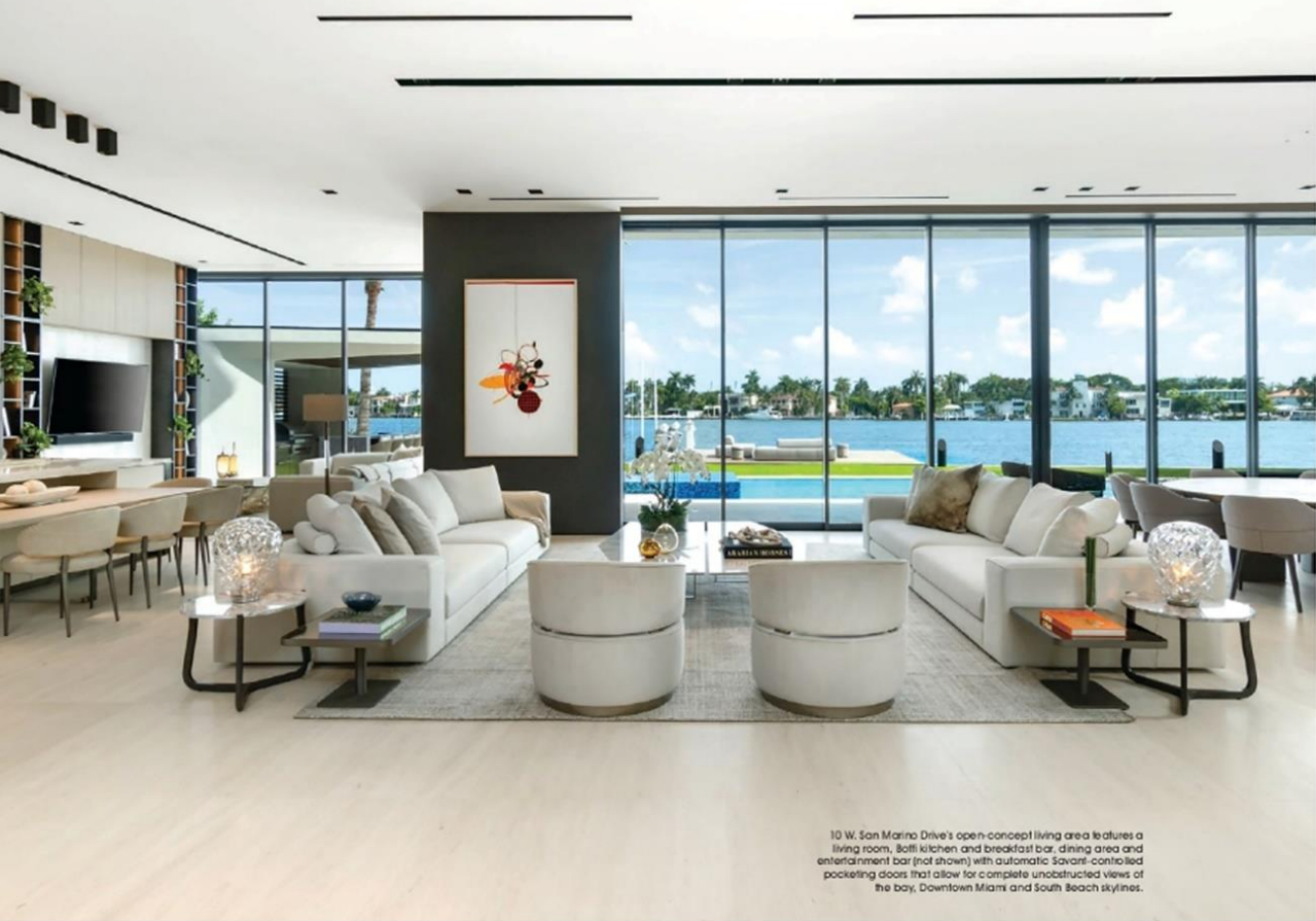
10 W. San Marino Drive's open-concept living area features a living room, Boffi kitchen and breakfast bar, dining area and entertainment bar (not shown) with automatic Savant-controlled pocketing doors that allow for complete unobstructed views of the bay, Downtown Miami and South Beach skylines.