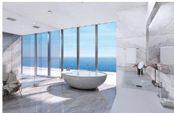
From top: The master bathrooms of Turnberry Ocean Club Residences feature a book-matched marble wall, steam showers and Italian imported stone. The view from the unit's 11-foot-deep sunset terrace overlooking the Intracoastal.

house—lends its name to its first residential tower, Missioni Baia. Located on the shores of Biscayne Bay, the Missoni team, OKO Group, Hani Rashid of Asymptote Architecture and Paris Forino Interior Design have joined forces to create 249 residences boasting resort-level amenities and that celebrate the timeless appeal of waterfront living in the relaxed, modern style that Missoni is known for. This particular north penthouse, located on the 57th floor, features two bedrooms and six bathrooms, a spacious family room, study, great room, service area, in-home gym, wraparound terraces and private elevator