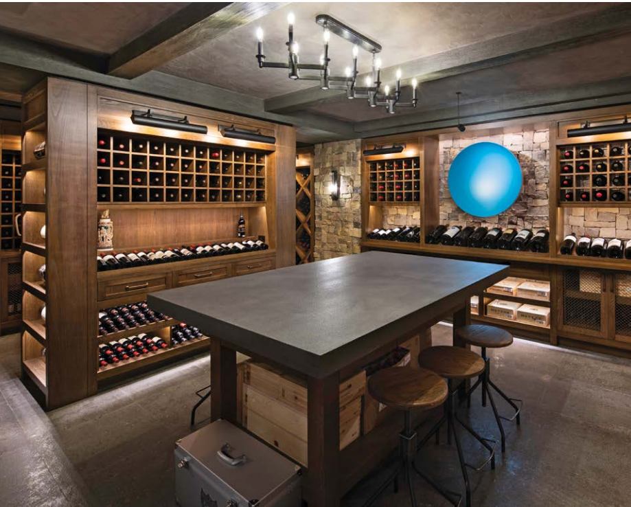
ABOVE: The wine cellar, which provides the proper refrigeration for the clients' prized bottles, features the artwork Blue Orb by sculptor Anish Kapoor, which brightens up the room.