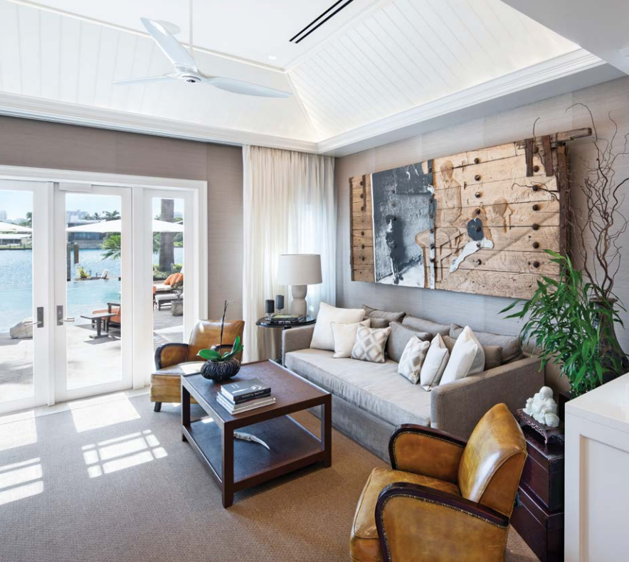
ABOVE: The guest suite includes a cozy sitting area with warm leather antique chairs and eclectic side tables. The artwork above the sofa is made up of scenes etched onto reclaimed wood barn doors.