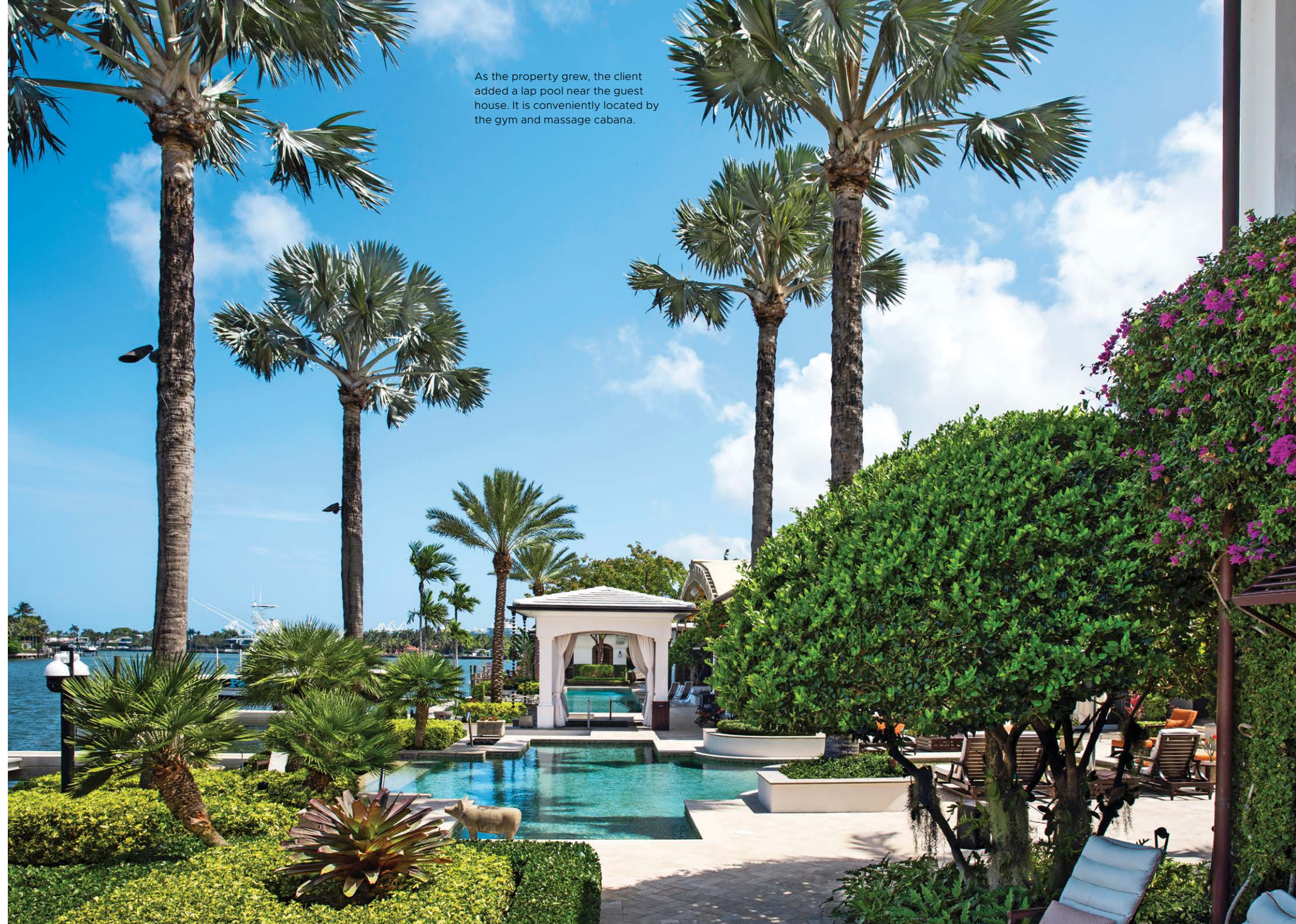
As the property grew, the client added a lap pool near the guest house. It is conveniently located by the gym and massage cabana.