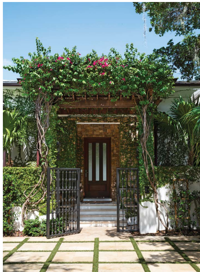
BELOW: The guest apartment connects the guest house to the main house; in order for its entry to not compete with the main entrance, it is surrounded by bougainvillea and iron gates.