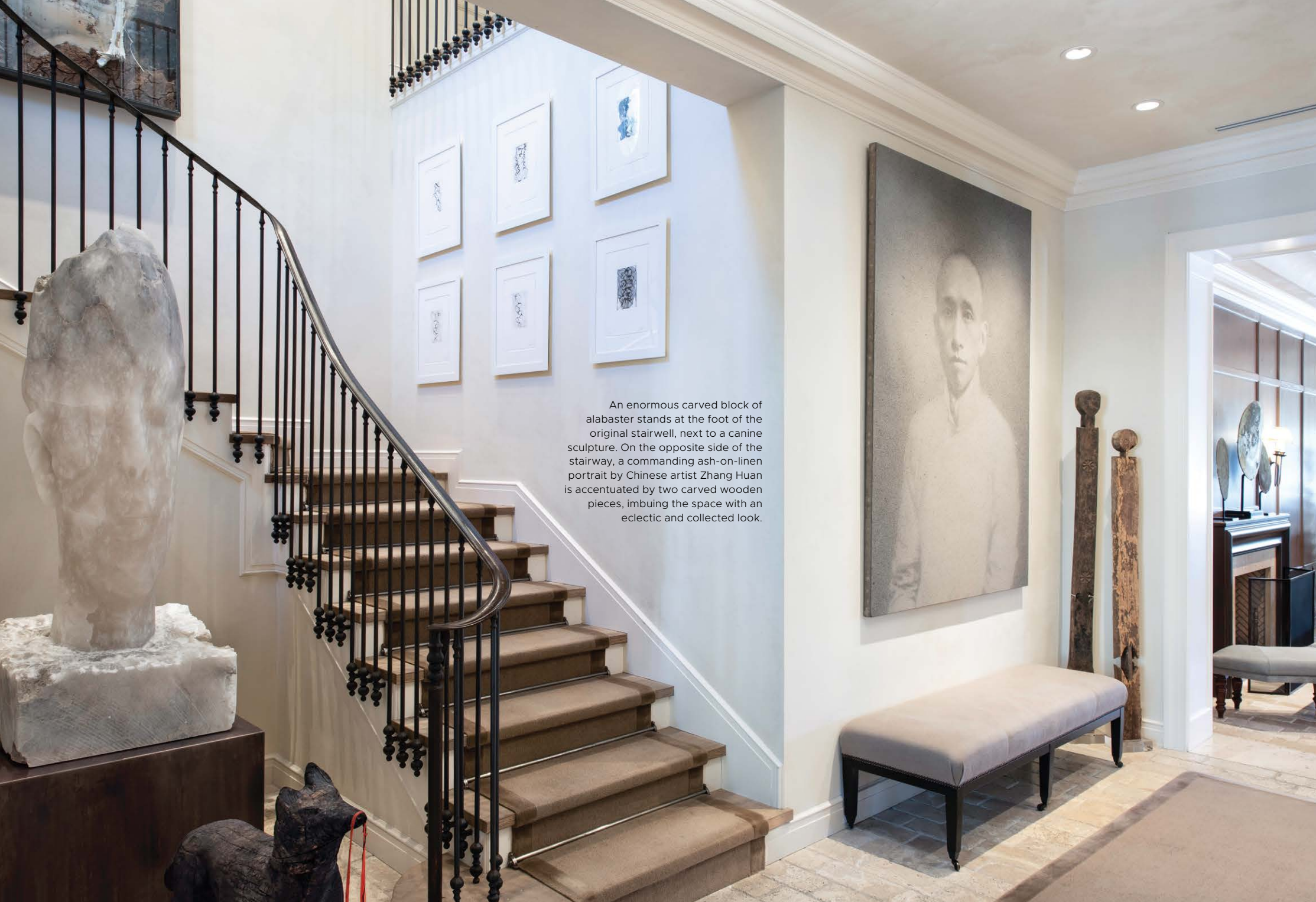
An enormous carved block of alabaster stands at the foot of the original stairwell, next to a canine sculpture. On the opposite side of the stairway, a commanding ash-on-linen portrait by Chinese artist Zhang Huan is accentuated by two carved wooden pieces, imbuing the space with an eclectic and collected look.