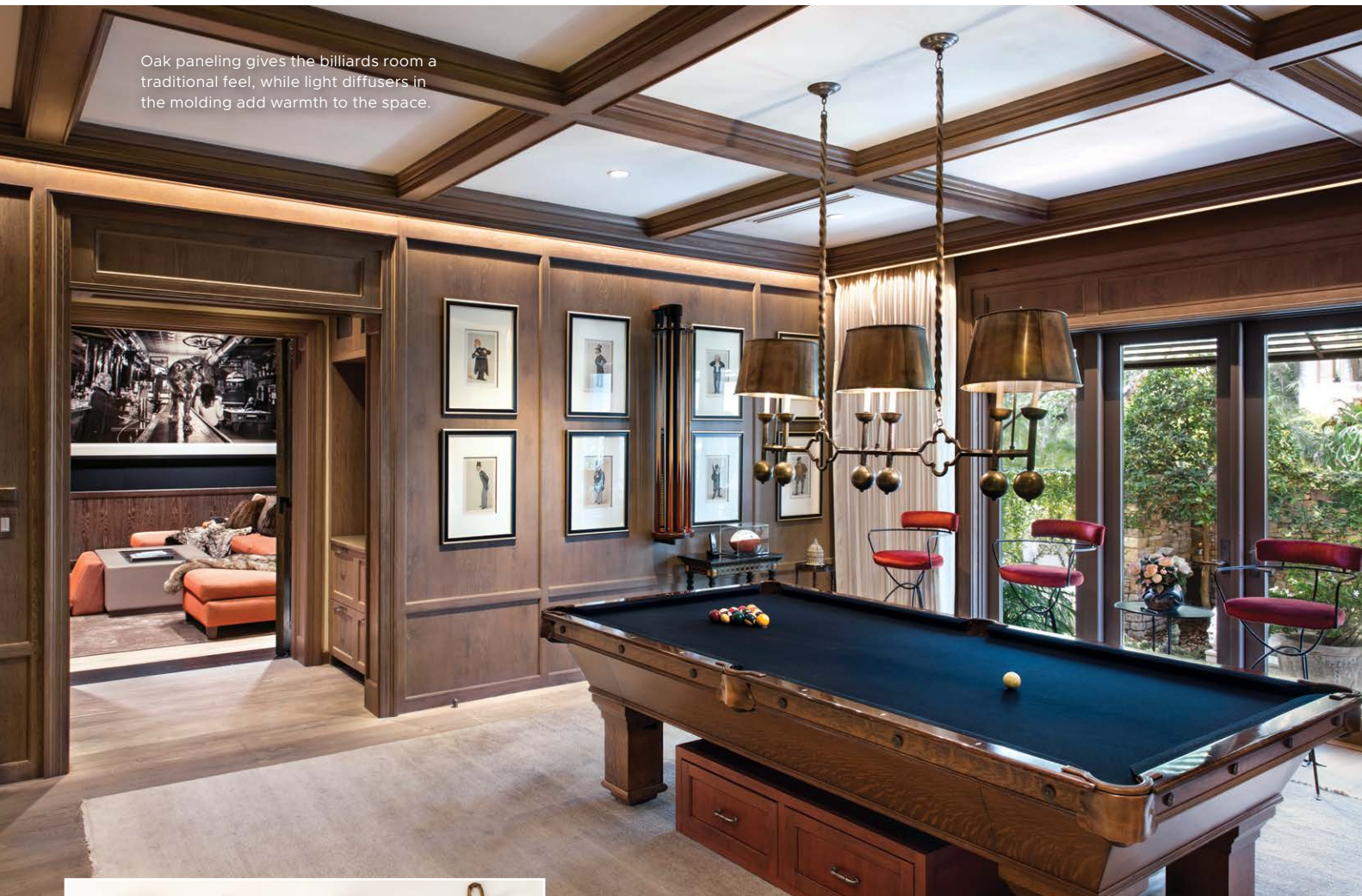
Oak paneling gives the billiards room a traditional feel, while light diffusers in the molding add warmth to the space.