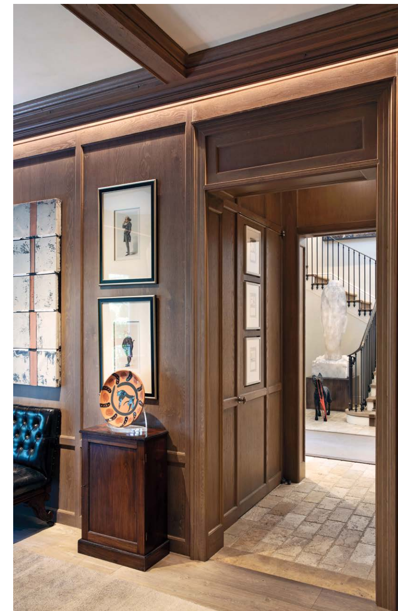
BELOW: The elevator alcove facing the stairway is one of the newer renovations and includes custom millwork with pocket doors. The additional wall space features artwork from the clients' collection. Dark wood walls and pale stone floors infuse the space with warm natural textures.

ARTISTS OFTEN WRESTLE WITH THE QUESTION of when a work is complete. Some homeowners are the same, but instead of a canvas or sculpture, their focus of attention is the space that surrounds them day in and out.